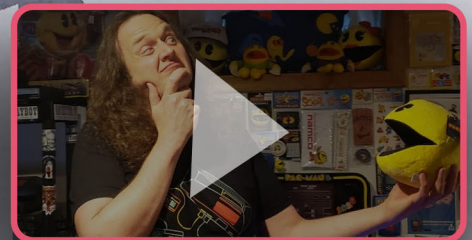
Pac-Man Is 40