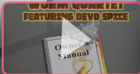
Take The Fire Back